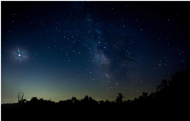
Arunah Hill at night featuring Mars and the Milky Way