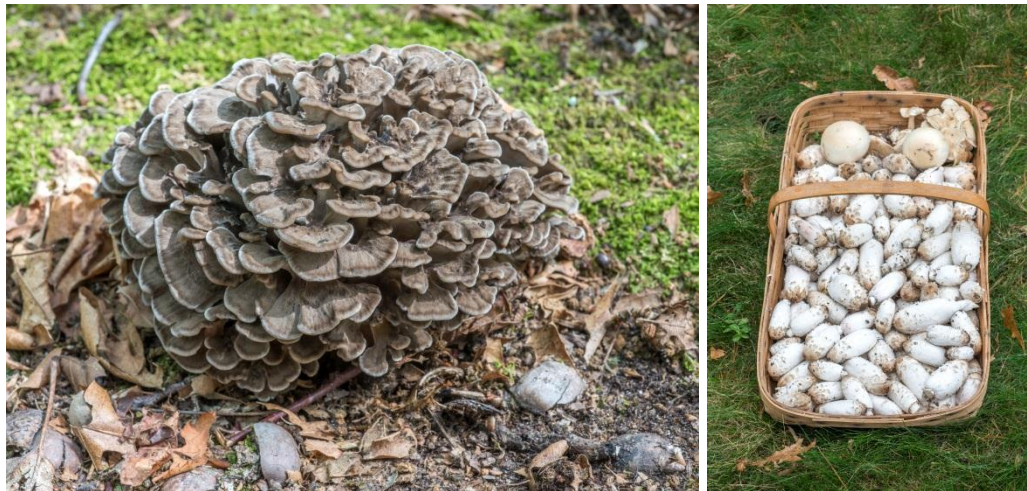
Grifola frondosa and a basket full of Coprinus comatus, some fall fungi

https://dpnc.org/calendar/wild-mushroom-festival-3/